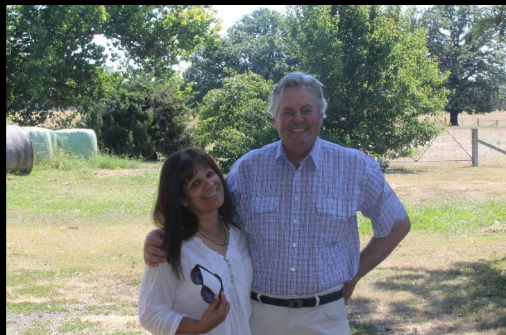
20/01/2018 – Celebrating 25 years at Glenwellyn.